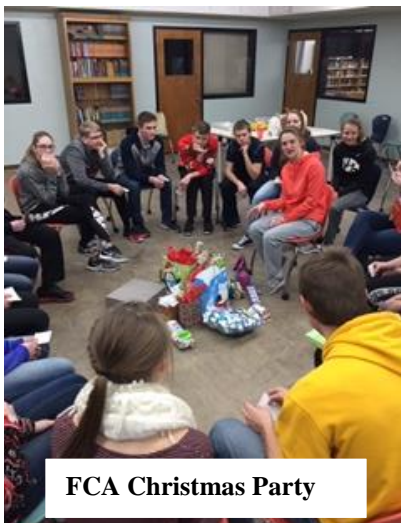
FCA Christmas Party