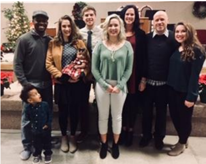
We were so blessed to have everyone home for Christmas!

“Make me know Your ways, O Lord; teach me Your paths. Lead me in Your truth and teach me, for You are the God of my salvation; For You I wait all the day.”