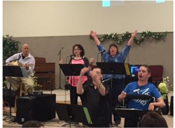
Above: Our Truth Singers Spring Concert ☺